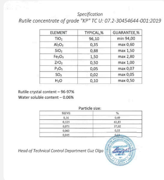
Rutile Concentrate (Grade "KP")

Each product is available with full technical specifications and SGS certification upon request.